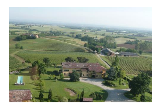
Then, check-in to "Hotel Al Mulino", Alessandria.