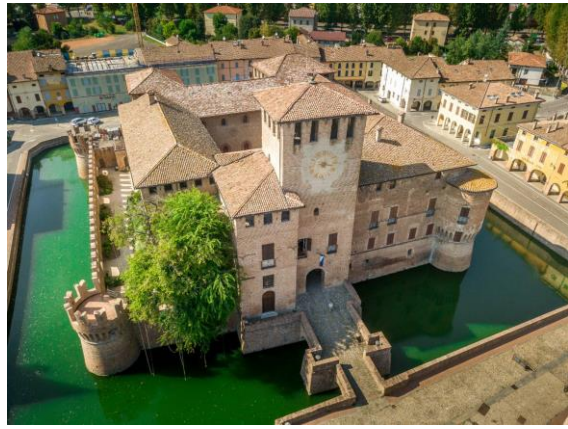
11:30 am: restart to Piedmont.

10:30 am: short visit to Sanvitale castle in downtown Fontanellato.